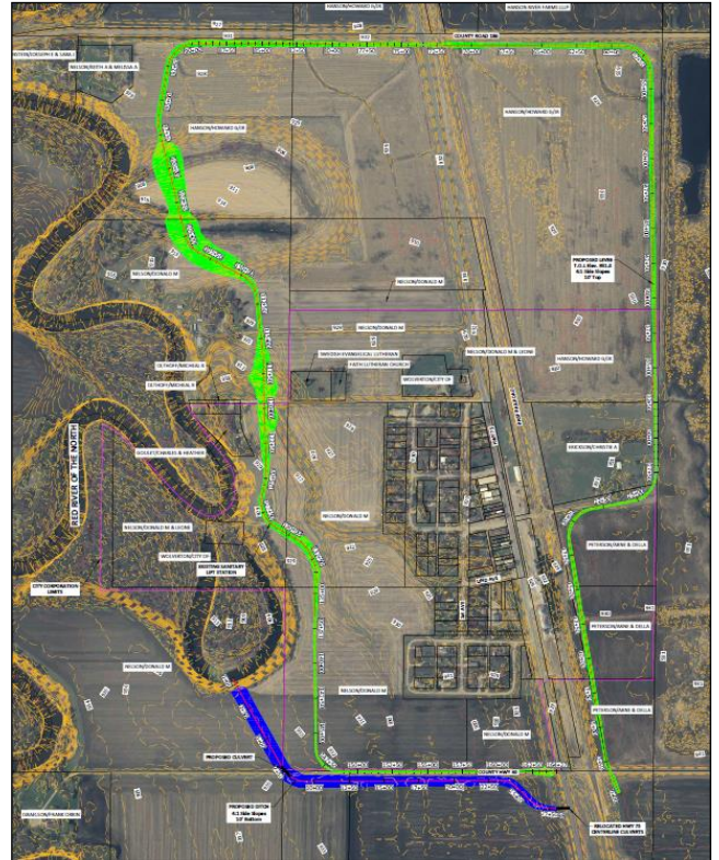
Map of City of Wolverton Levee

In 2022, BRRWD signed the Memorandum of Understanding (MOU) with the MFDA to support project. Houston Engineering, Inc. completed survey work to inform project design. BRRWD met with the City to begin project development. BRRWD continued coordinating with landowners, City, Railroad, and Minnesota Department of Transportation (MNDOT) and finalize levee design in 2023 and 2024. In 2024, BRRWD hired Crown Appraisals, Inc to determine land values for easement acquisition. BRRWD also held a landowner meeting to discuss project design. BRRWD established City of Wolverton Flood Mitigation Project by resolution in December 2024. Land acquisition is expected to commence in 2025.