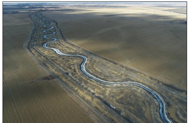
Stony Creek Restoration after construction.