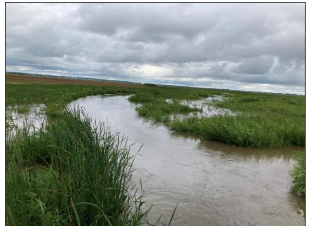
Stony Creek Restoration.