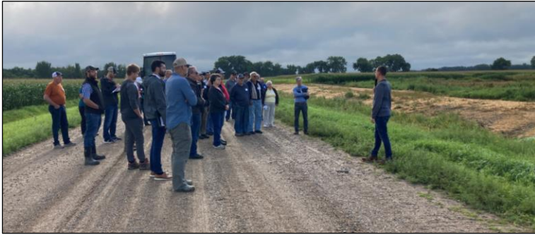
Glyndon East Tributary Restoration

August 2024 - BRRWD hosted a project tour. Tour stopped at Glyndon East Tributary Restoration, Clay County Ditch No. 41 Outlet Repair/ Snakey Creek, Stony Creek Restoration, and Whisky Creek and South Tributary.