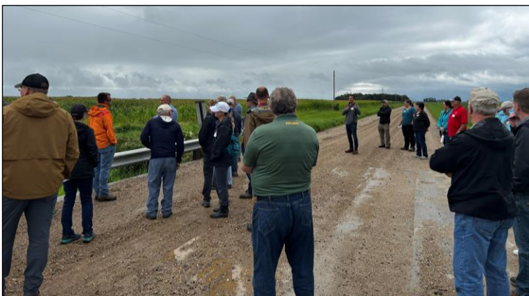
Whisky Creek South Tributary.