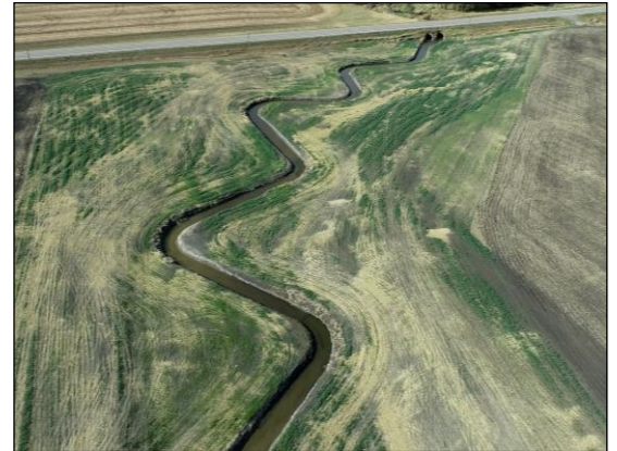
Whiskey Creek Enhancement Project after construction.

A hearing was held April 2021 to establish the Whiskey Creek Enhancement Restoration as a watershed project. Contract for Phase 1 was awarded to Ehlert Excavating, Inc. in June 2021. Construction of Phase 1 was completed in November 2021. Ehlert Excavating, Inc. completed Phase 2 of construction in September 2022. In 2023, BRRWD began acquiring permanent easement for Phases 1 and 2 and acquired temporary easements for Phases 3 and 4. Contract for Phase 3 was awarded to Ehlert Excavating, Inc. in April 2023 and construction began in June 2023. In August 2023, Contract with Ehlert Excavating, Inc. was extended to include Phase 4. Phase 4 construction continued through 2024. Contract expected to close in 2025 once vegetation is established.