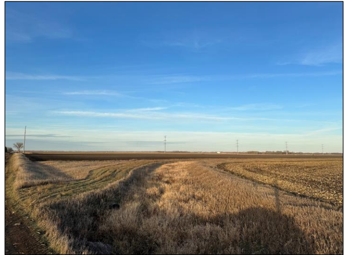
Whisky Creek before construction.

In 2025, BRRWD plans to continue working on project design and looking for project funding.