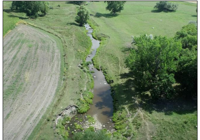
Stony Creek Restoration before construction.

In February 2023, BRRWD hired Natwick Appraisals to determine land values for acquisition of permanent easements. A Final Hearing was held in June 2023. With the approval of the Findings and Order, easements were acquired for construction and long-term maintenance of the project. Contract was awarded to ACM, LLC in August 2023. Construction commenced in September 2023 and continued through 2024. Contract is expected to close in 2025 once vegetation is established.