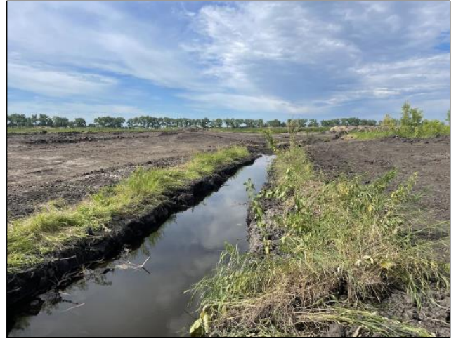
Glyndon East Tributary Restoration under construction.

The hearing to establish the Glyndon East Tributary Restoration as a project was held in May 2022. With the approval of the Findings and Order, temporary and permanent easements were acquired for construction and long-term maintenance of the project. Contract was awarded to States Borders Construction, Inc. in November 2022. Construction commenced in May 2023 and continued through 2024. Contract is expected to close in 2025 once vegetation is established.