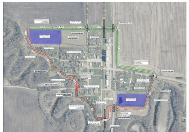
Map of City of Georgetown Levee

In 2022, BRRWD signed the MOU with the MFDA to support project. Houston Engineering, Inc. completed survey work to inform project design. In 2023, BRRWD continued coordinating with landowners, City, Railroad, and MNDOT and finalize levee design. In 2024, BRRWD hired Natwick Appraisals to determine land values for easement acquisition. BRRWD also held a landowner meeting to discuss project design. BRRWD established City of Georgetown Flood Mitigation Project by resolution in December 2024. Land acquisition expected to commence in 2025.