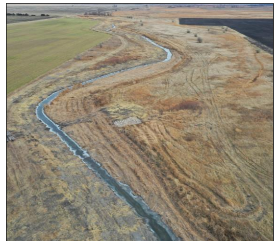
South Branch Buffalo River Restoration after construction.

In 2021, Board of Managers accepted the Engineer's Report, began acquiring project funding, and completed the Environmental Assessment Worksheet. The hearing to reroute and partially abandon Wilkin County Ditch No. 44 was held in February 2022. Construction contract for Phase 1 was awarded to Minnesota Native Landscapes in June 2022. Construction commenced in September 2022 and continued through 2024. Contract is expected to close in 2025 once vegetation is established.