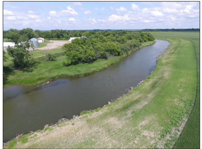
Straightened portion of Lower Otter Tail River Restoration before construction.

In February 2022, an informational meeting was held with landowners. In May 2022, the Findings from the Environmental Assessment Worksheet was approved. Fall 2022 BRRWD continued outreach efforts to landowners. In 2023, BRRWD worked with Wilkin SWCD on landowner outreach and finalized design for Phase 1. In 2024, BRRWD continued to coordinate outreach to landowners. Phase 1 expected to commence in 2025.