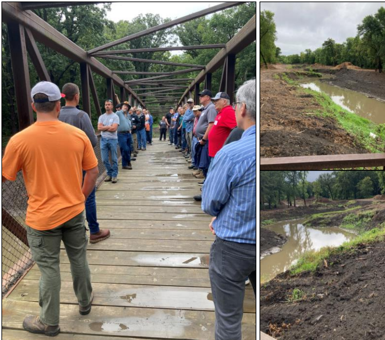
Clay County Ditch NO. 41 Outlet Repair/ Snakey Creek.