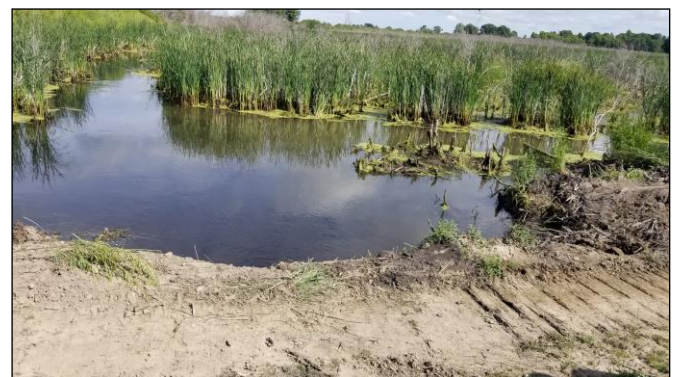
Upper Buffalo River Restoration before construction.

In November 2023, BRRWD held an informational meeting and hired Natwick Appraisals to determine rates for land acquisition. BRRWD continued project design and landowner outreach in 2024. Construction is expected to commence in 2025.